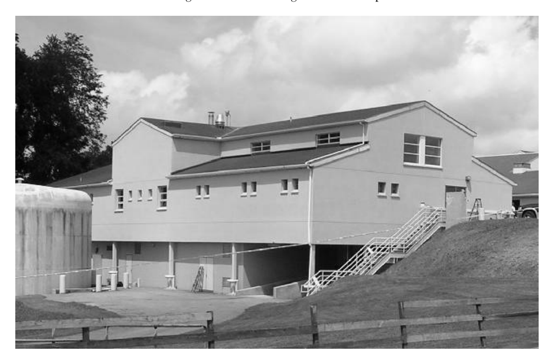
Figure 1 George D. Widener Large Animal Hospital