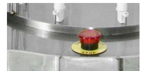
Emergency Stop Button