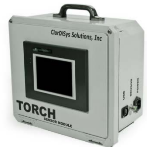
Torch Sensor Module